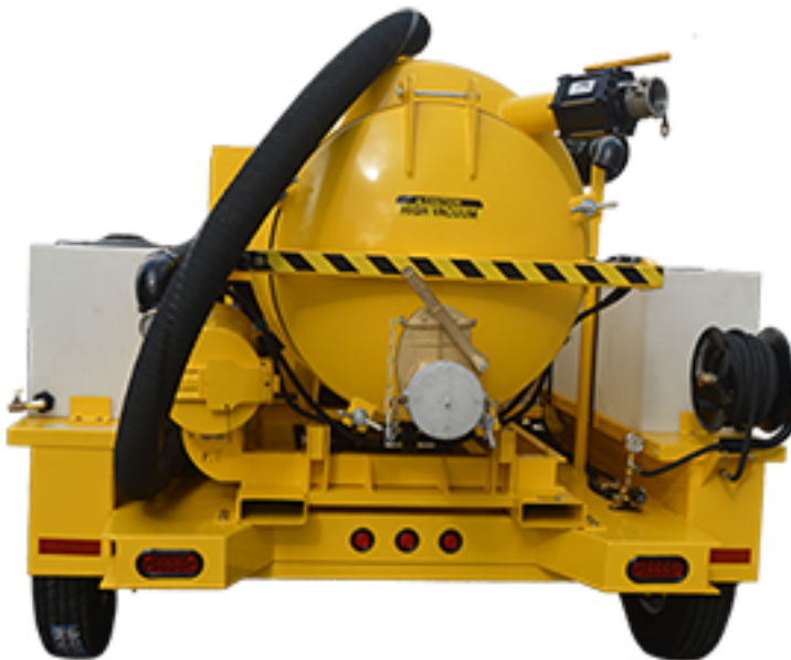
200 or 400 Gallon Fresh Water Saddle Bag Tanks