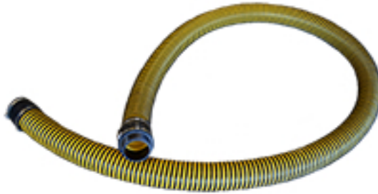
Hose Set 56-16039