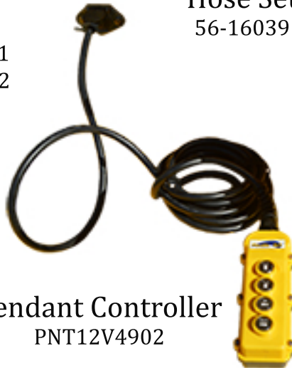
Pendant Controller PNT12V4902