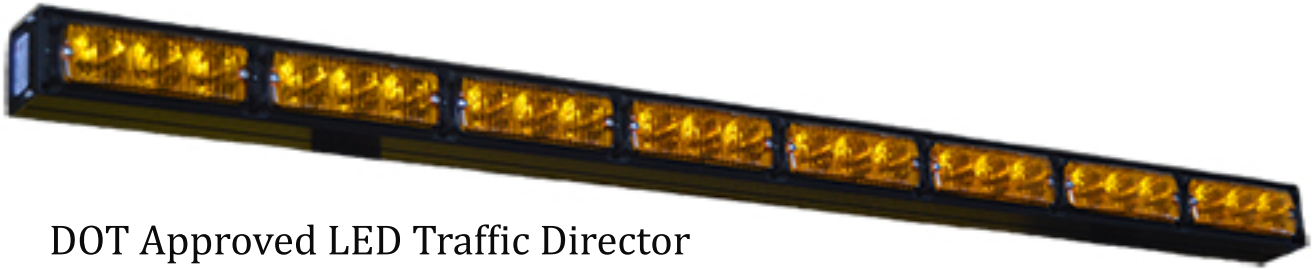
DOT Approved LED Traffic Director