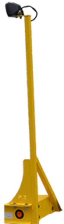
Flood Light Set