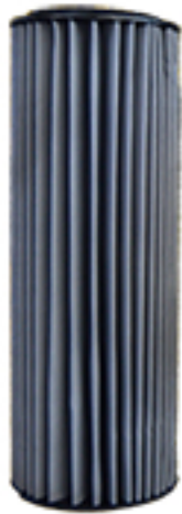
Vacuum Filter Small Filter: 51-11001 Large Filter: 53-13002