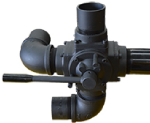
Vacuum Reverse Flow