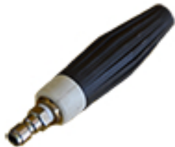
Turbo Nozzle 3000 PSI: 61-01015 4000 PSI: 61-01016